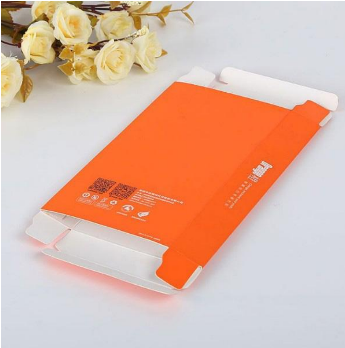
Sinst Printing Boxes for Power Bank Process